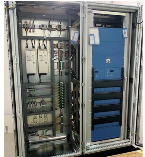
Typical UOP LHCS Retrofit Cabinet Layout

Features such as hot shutdown state, white burn inhibit mode, and regeneration burn zone temperature protection have been incorporated into the LHCS retrofit. These new features provide both operational benefits and enhanced troubleshooting tools.